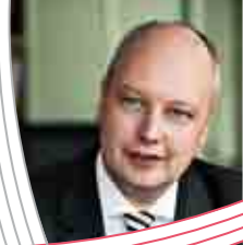
Jörg Bode, Minister for Economics, Labour and Transport of Niedersachsen

I wish all participants a successful run of the convention, interesting new contacts and a pleasant stay in Stade.