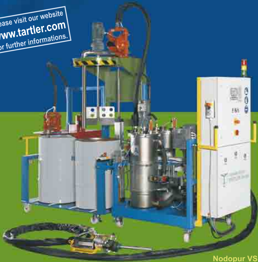
Nodopur VS AR

Please visit our website www.tartler.com for further informations.